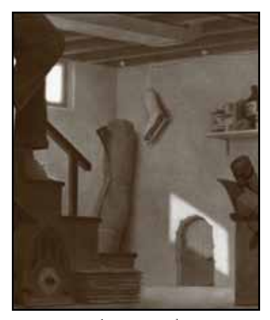
His heart was pounding. He was sure he had seen the doorknob turn.