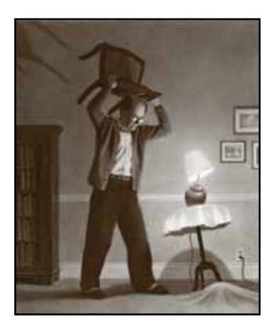
Two weeks passed and it happened again.

What do you think Archie will find if he goes to the park tomorrow to look in the bushes?