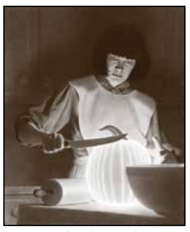
She lowered the knife and it grew even brighter.

How do you know you are real? How can you prove it?