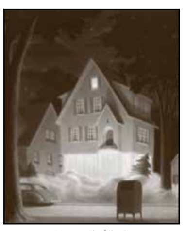
It was perfect lift-off.

Do you think that when the caterpillars transform into butterflies they will still communicate with Alice?