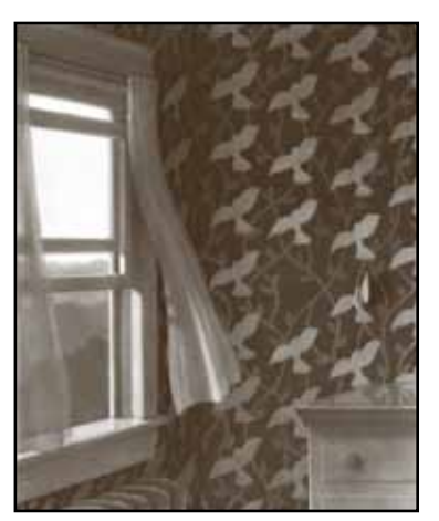
It all began when someone left the window open.

Pearlie believes the break in the wallpaper pattern is proof of something. What do you think it is proof of?