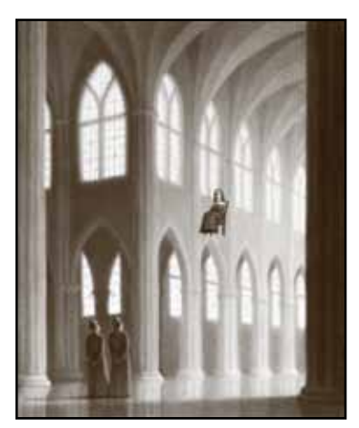
The fifth one ended up in France