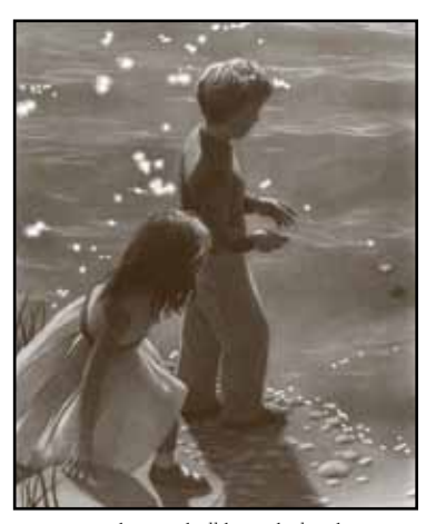
He threw with all his might, but the third stone came skipping back.

How does the narrator put Grandma's advice, "Don't put off until tomorrow what you can do today," (p. 12) to good use?