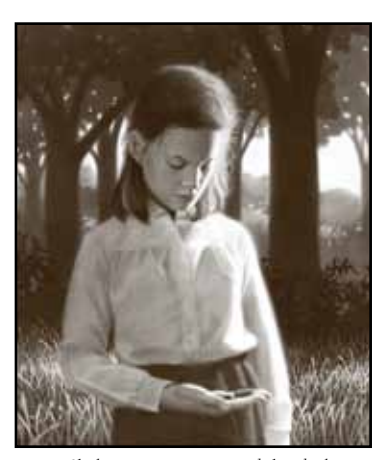
She knew it was time to send them back. The caterpillars softly wiggled in her hand, spelling out "goodbye."