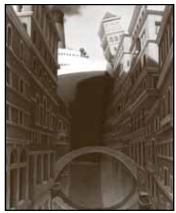
Even with her mighty engines in reverse, the ocean liner was pulled further and further into the canal.